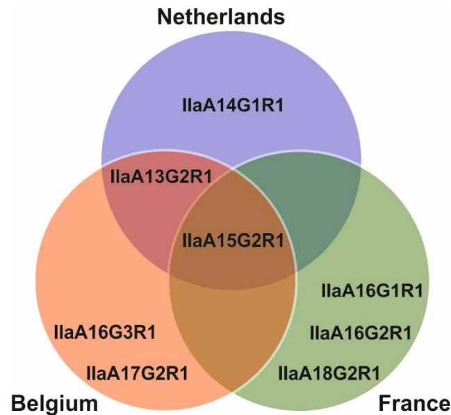
Figure 3. Venn diagram with all observed C. parvum gp60 subtypes across Belgium, France, and the Netherlands.

Using 18S rRNA sequencing and phylogenetic analyses, a total of 155 samples were identified as C. parvum positive. PCR products of the gp60 gene were successfully obtained for 137 (88.4%) of these cases. Sequence analysis and subsequent subtyping revealed the presence of eight different subtypes belonging to the Ila subtype family (Figure 3).