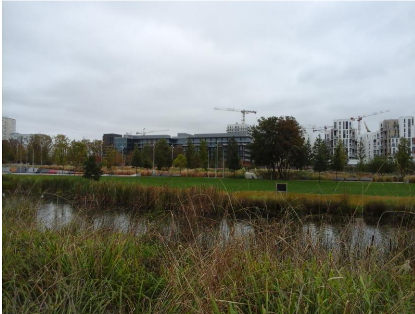
Fig. 2 – The main park of the Docks-de-Seine.

The two case studies chosen show a different vision of the issue of creativity at territorial level as they were not developed at the same period. In the current paper we will compare the creative territorial policies adopted for the two case studies in order to underline that the political, economic and social context plays a major role in the strategies of creativity in a city by promoting several times gentrification, especially in peripheral areas.