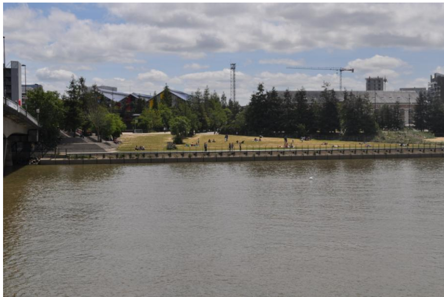
Fig. 1 – The park of the shipyards in Ile-de-Nantes.

Nantes is located in the west of France with an area of about 6500 hectares. Its population in 2017 was about 300000 inhabitants. Nantes, which is known for the redevelopment of former industrial brownfields as Ile-de-Nantes, was chosen as a case study due to the significant population decline that faced after the closure of the local industries in the late 1980's.