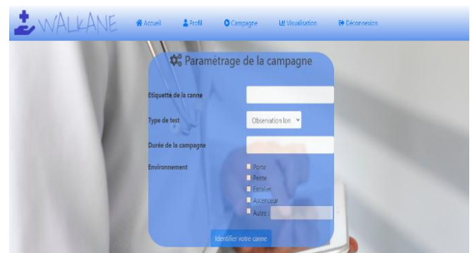
Figure 4. Configuration of the Walkane Application

through the application the list of characteristics of the environments such as doors, slopes, stairs, falls and so on. During the walk experimentation, the observer will tag the various events and label manually if the imbalance occurs. The output of the Walkane application completes the cane data with a feature for the environment and the binary label of imbalance (0/1) which is the target of the prediction. The synchronization between both data is set up using the BLE connection supported by the ESP32 board. Concretely, once the observer selects the cane of the observed user, a message is sent via the BLE interface to ask the ESP32 to start the measurements and the data recording from the sensors integrated therein. When the experiment ends, the same mechanism is repeated with another value of the message to stop recording.