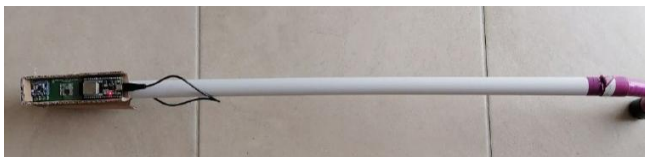
Figure 2. The Smart Cane prototype

Our smart stick is presented in Figure 2. At the bottom of the stick we find an embedded system based on an ESP32 board. It contains a 3D Accelerometer measuring linear acceleration and a 3D magnetometer capturing the variation of the magnetic field. We have then nine raw features collected from the stick: (lx,ly,lz) for acceleration, (mx,my, mz) for magnitude and (raw, pitch, yaw). Our embedded system is presented in Figure 3. The ESP32 is a single chip combo that supports short-range wireless communication namely WiFi and BLE. The cane also supports LoraWAN communication technology thanks to the integration of an RFM95 chip and the LMIC library.