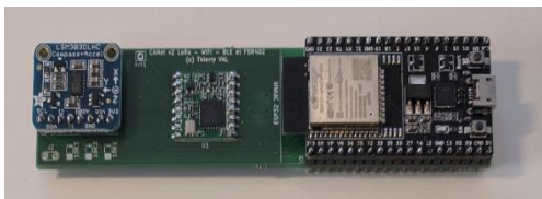
Figure 3. The embedded system