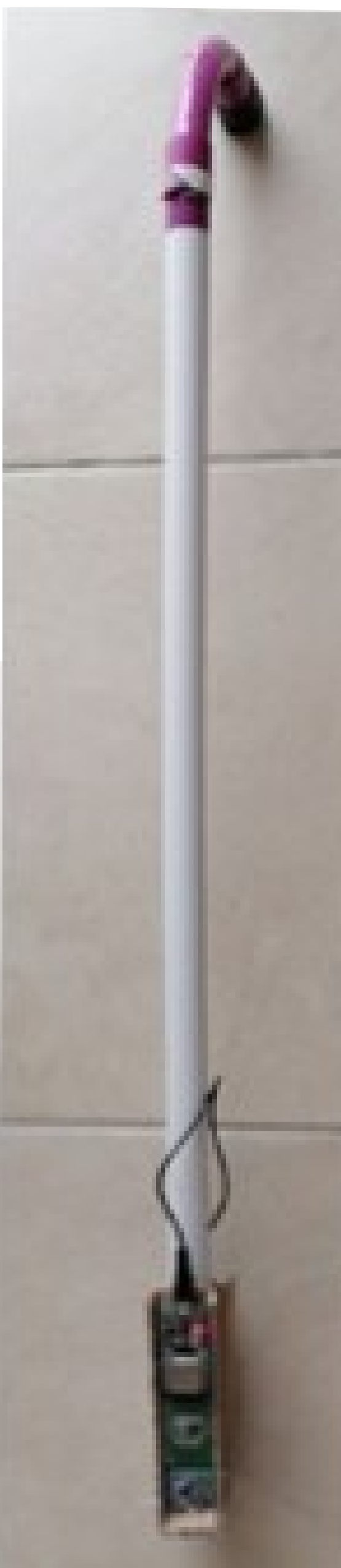
A Smart Stick