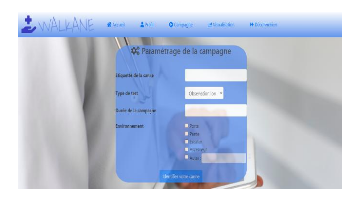
Figure 4. Configuration of the Walkane Application

through the application the list of characteristics of the environments such as doors, slopes, stairs, falls and so on. During the walk experimentation, the observer will tag the various events and label manually if the imbalance occurs. The output of the Walkane application completes the cane data with a feature for the environment and the binary label of imbalance (0/1) which is the target of the prediction. The synchronization between both data is set up using the BLE connection supported by the ESP32 board. Concretely, once the observer selects the cane of the observed user, a message is sent via the BLE interface to ask the ESP32 to start the measurements and the data recording from the sensors integrated therein. When the experiment ends, the same mechanism is repeated with another value of the message to stop recording.