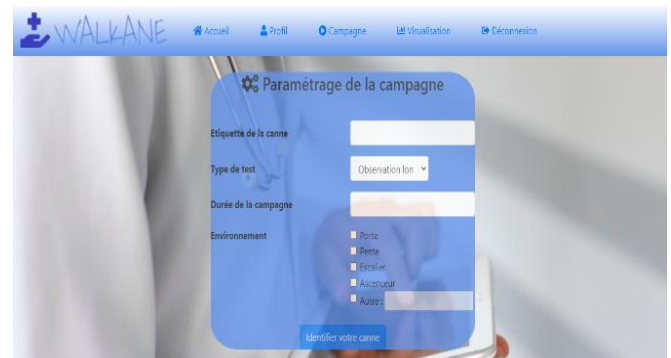
Figure 4. Configuration of the Walkane Application

through the application the list of characteristics of the environments such as doors, slopes, stairs, falls and so on. During the walk experimentation, the observer will tag the various events and label manually if the imbalance occurs. The output of the Walkane application completes the cane data with a feature for the environment and the binary label of imbalance (0/1) which is the target of the prediction. The synchronization between both data is set up using the BLE connection supported by the ESP32 board. Concretely, once the observer selects the cane of the observed user, a message is sent via the BLE interface to ask the ESP32 to start the measurements and the data recording from the sensors integrated therein. When the experiment ends, the same mechanism is repeated with another value of the message to stop recording.