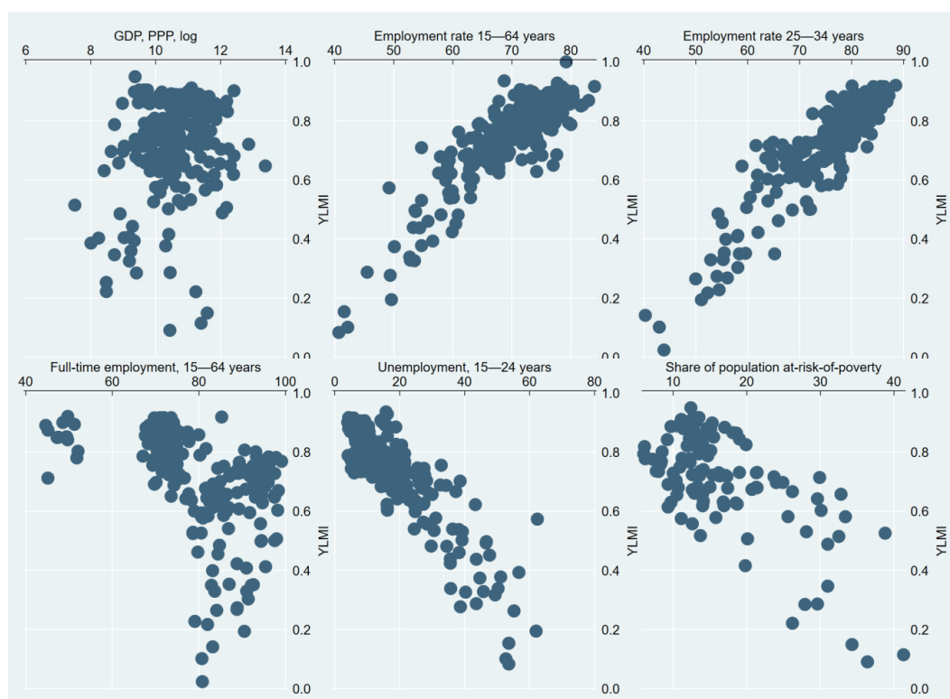
Figure 1. Matrix scatterplots of YLMI with selected economic, labor market, and education indicators.

The index positively correlates with variables on economic well-being, such as the GDP (at Purchasing Power Parity (PPP) per capita), showing that competitive regional economies tend to present higher levels of youth integration. Not surprisingly, correlations are particularly pronounced with labor market indicators on employment, coherently with previous research highlighting the positive association between good overall labor market conditions and youth employment [1]. Conversely, it negatively correlates with the share of full-time employment. This shows that the index accurately mirrors the dynamics of youth integration as result of a mix of socioeconomic conditions and policy interventions. The phase of transition into the labor market is often characterized by nonstandard employment as opposed to full-time standard employment of the core of the labor force.