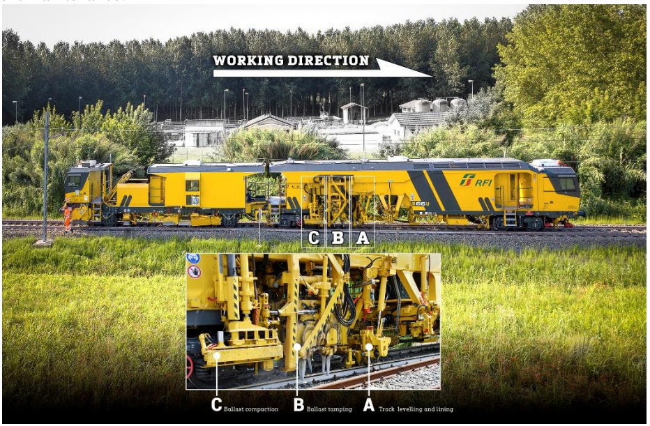
Fig. 1: Ballast tamping machine in operation

After the operation, the ballast is compacted enough (detail C in Fig. 1), to allow trains to travel over it without deformation of the track. This equipment is subjected to strong mechanical constraints sometimes due to heterogeneity of the ballast, so they need frequent maintenance.