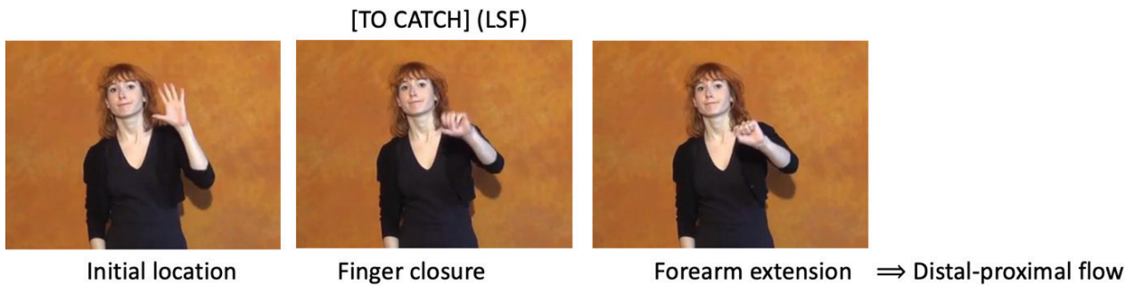
Figure 6. Articular decomposition of the sign [TO CATCH] in French Sign Language (spreadthesign.com).

mathematical notions during multimodal “linguaging” (Linell 2009). We analyzed the expression of aspect in French, Russian and German by correlating the analysis of verbal forms with that of synchronously produced gestural forms. Our hypothesis was that the differences between perfective and imperfective aspects could be correlated with kinesiological aspects of gestures. The idea was that certain kinesiological features, and in particular the quality of the movement, could make the semantic differences truly tangible. The nature of the co-verbal gestures used by speakers could thus be linked to aspectuality and their specific features might be captured in our detailed annotations.