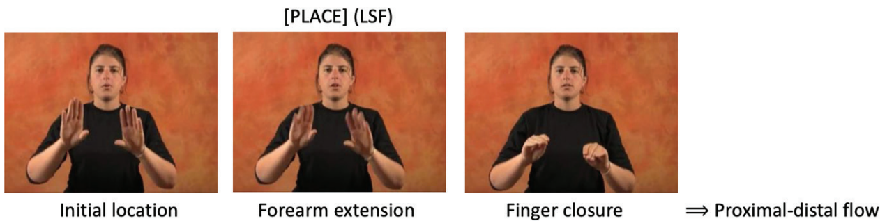
Figure 5. Articular decomposition of the sign [PLACE] in French Sign Language (spreadthesign.com).