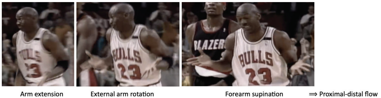
Figure 3. Articular decomposition of an epistemic negation performed in context. Screen shots (Michael Jordan) are extracted from the video on line https://www.youtube.com/watch?v=gbnjKR8UHLk&ab_channel=ESPNESPNValid%C3%A9 (Timing around 47 seconds).

without the participants having to wear motion sensors, which can be invasive for the speaker or signer.