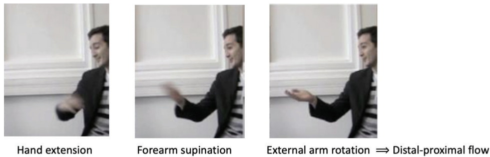
Figure 4. Articular decomposition of a presentation gesture performed in context. These screen captures are extracted from the data set collected in France for the Polimod project funded by the Russian Science Foundation (Cienki and Iriskhanova 2018; Boutet et al. 2018a–c; Morgenstern et al. 2017).

between these gestures. The analysis of gestures in terms of images (McNeill 1992), which is based on the visual modality, does not take into account each of the gestural articulators, their organization, their dynamics, but they are necessary to highlight the structural differences that inform their semantic differences.