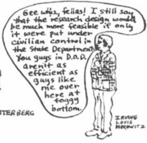
Fig. 13.1 "Breaking out of the Hothouse"

Or, just see your Department Chairman for details and an application form today. Remember that the University of Chicago Press, like the great City of Chicago itself, operates a tight ship to serve the National Interest. Only the highest standards of objective scholarship and professional competence are tolerated in our modern laboratories and assembly lines. Due to multi-dimensional factors beyond our control, however, the MO-JAN SYSTEM cannot be guaranteed once it is installed by our engineers. Morris Janowitz, author of "The Urban Control of Escalated Riots," has said that "the MO-JAN belongs in every American home, and I even keep an extra unit handy at my office. I highly recommend it to all my friends."