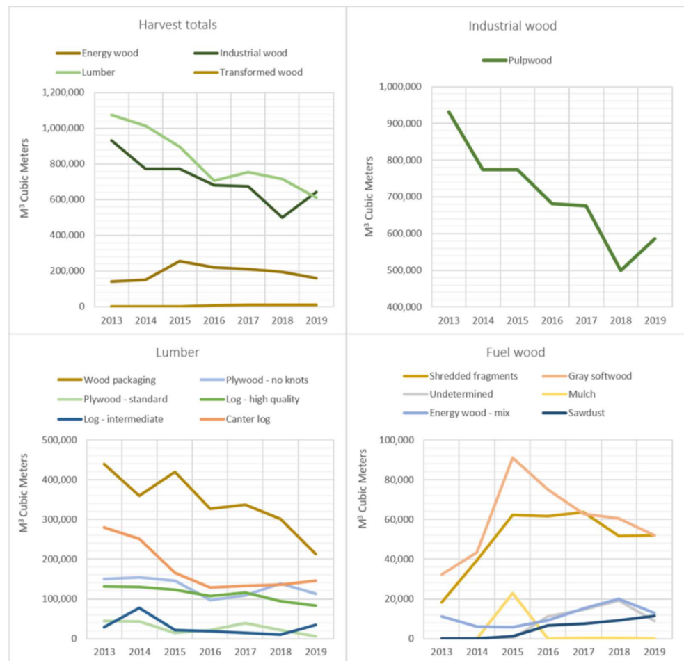
Figure 4. Consolidated harvest totals detailing flows of industrial, energy and lumber wood from 2013 to 2019.