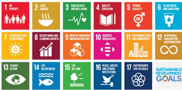
Fig. 4. Sustainability Goals [29]