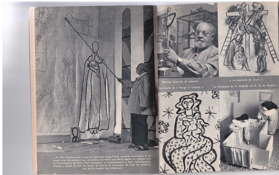
Fig. 3 'Portrait. Yeux bleus, barbe blanche, lunettes d'or. Henri Matisse', Caliban , no. 52 (June 1951), 59–60