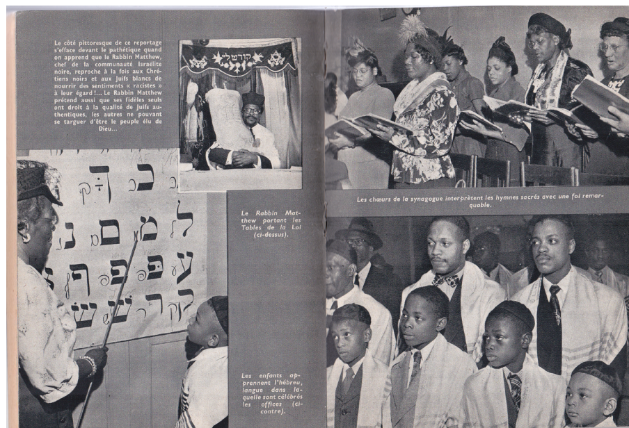
Fig. 4 'Avec les Juifs noirs de Harlem', Caliban , no. 52 (June 1951), 66–67