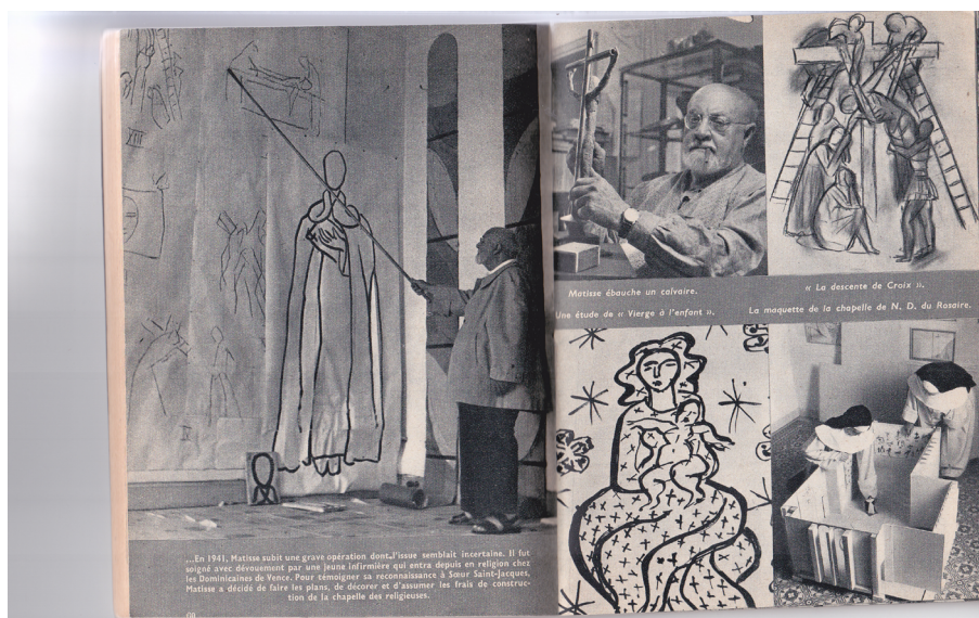
Fig. 3 'Portrait. Yeux bleus, barbe blanche, lunettes d'or. Henri Matisse', Caliban , no. 52 (June 1951), 59–60