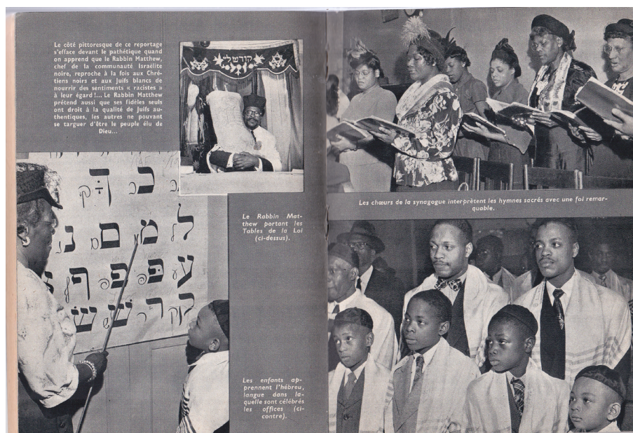
Fig. 4 'Avec les Juifs noirs de Harlem', Caliban , no. 52 (June 1951), 66–67