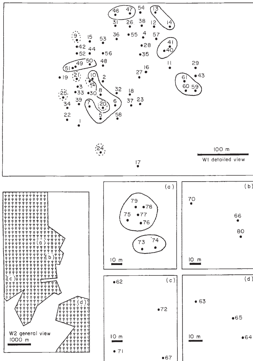
Fig. 1 Spatial distribution of trees in wild cherry populations W1 and W2. Numbers refer to individual trees, represented as dots, heavy lines indicate the position and the limits of the supposed clone groups and dotted lines indicate trees which are too widely separated to be included in the supposed clone groups: tree no. 9 from the clone group no. '5-6-7-8-10', tree no. 20 from tree no. 21, tree no. 24 from tree no. 25, and tree no. 45 from the clone group no. '46-47'.

In population W1, 8 groups with identical genotypes were found among 61 trees. Most of them were geographically gathered, which suggested a clonal origin (groups 40-41, 46-47 and 49-50; Fig. 1), but remembering that trees were sampled 30 m apart, the probability of obtaining through sexual reproduction a homogeneous group of at least size n ( n = observed