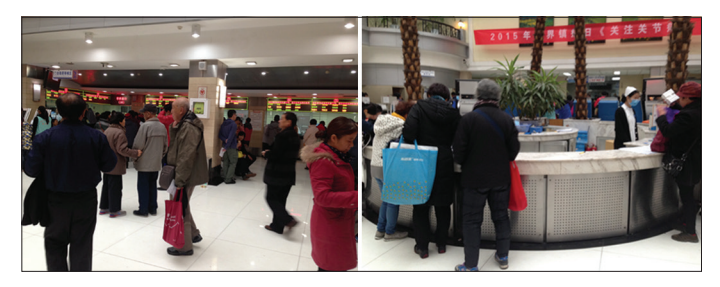
Figure 3. The situation in the Accident and Emergency Department, Hospital of Beijing University, People's Hospital at 10:00 am on a weekday in November 2015.