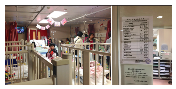
Figure 2. A room in the children's department and the waiting list displayed in Queen Mary hospital, Hong Kong.

Today, a growing number of Tier 1 and AAA hospitals admit patients only after online pre-registration. It is done with a mobile phone app. Features included in apps such as WeChat include advanced functionalities, such as sharing blood test results or other diagnoses between medical staff and patients. According to many doctors, this system of registration has already changed the