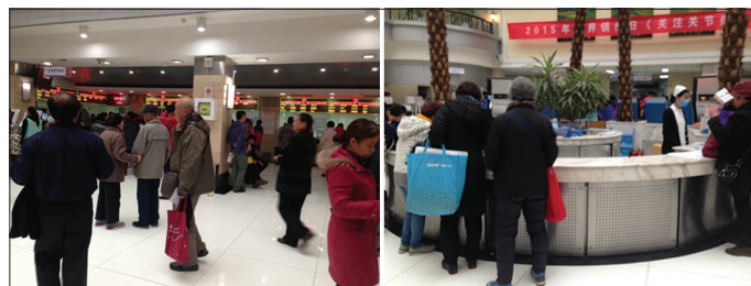
Figure 3. The situation in the Accident and Emergency Department, Hospital of Beijing University, People's Hospital at 10:00 am on a weekday in November 2015.