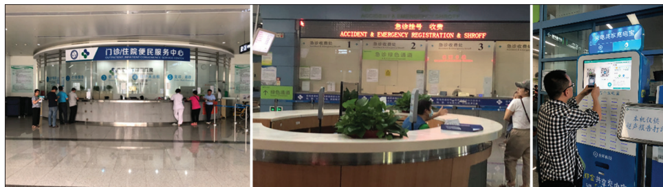
Figure 5. The situation in the Accident and Emergency Department, Hospital of Shenzhen at 2:30 pm on a weekday in May 2018.