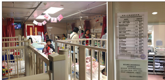
Figure 2. A room in the children's department and the waiting list displayed in Queen Mary hospital, Hong Kong.

Today, a growing number of Tier 1 and AAA hospitals admit patients only after online pre-registration. It is done with a mobile phone app. Features included in apps such as WeChat include advanced functionalities, such as sharing blood test results or other diagnoses between medical staff and patients. According to many doctors, this system of registration has already changed the