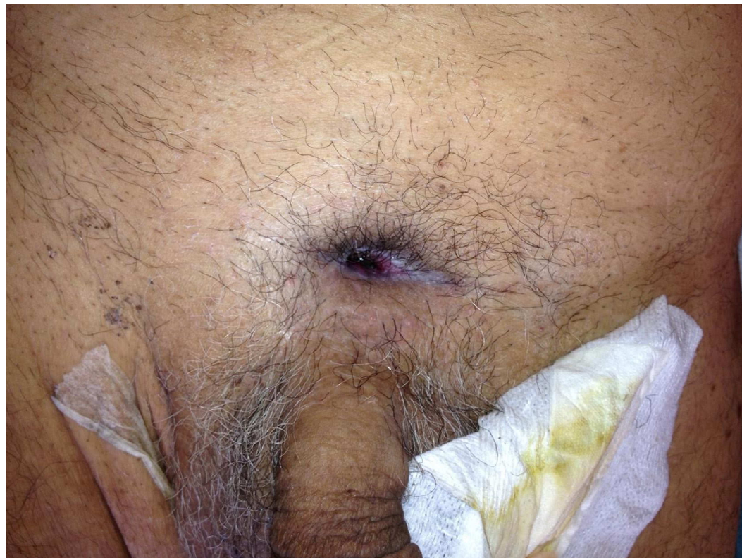
Figure 1. Suprapubic fistula in a patient with polymicrobial osteomyelitis after urological surgery for bladder cancer.

Figure 1. Fistule sus-pubienne peu productive chez un patient présentant une ostéomyélite polymicrobienne dans les suites d'une chirurgie urologique pour cancer de vessie.