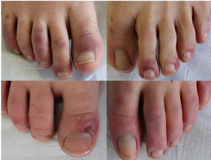
Figure 1: Exemple of 4 patients referred for chilblains