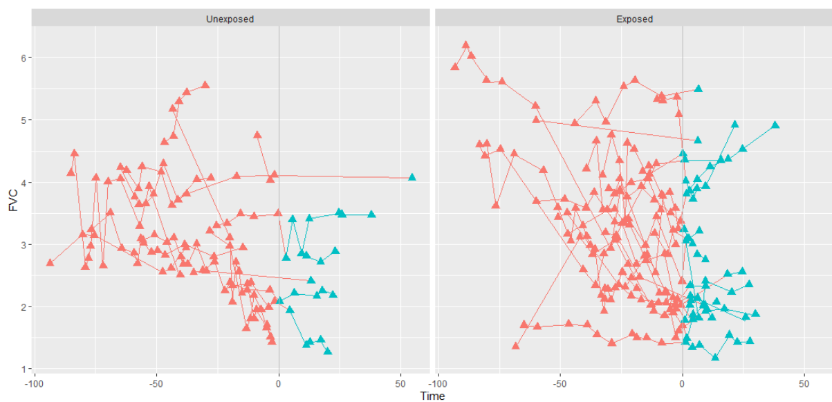
Figure 3: Spaghetti Plot of the FVC trajectory over time in the 23 matched patients unexposed (left plot) or exposed (right plot) to ruxolitinib.

Similar results were found for FVC trajectory. Indeed, no evidence of any effect of ruxolitinib exposure was observed on the time course of FVC ( p= 0.47 ) ( Figure3 ).