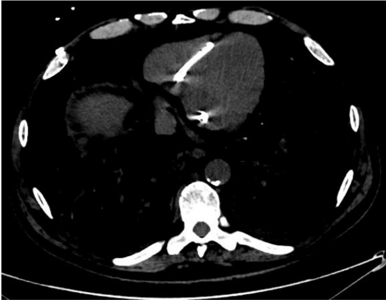
Figure 2: Intra-atrial tunneled dialysis catheter in patient n°1 (computed tomography scan).