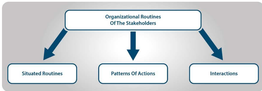
Fig. 2. Content of Organizational Routines

As a result, Hypothesis 2 (H2) is as follows: the controversy is defined as the confrontation of stakeholders' organizational routines.