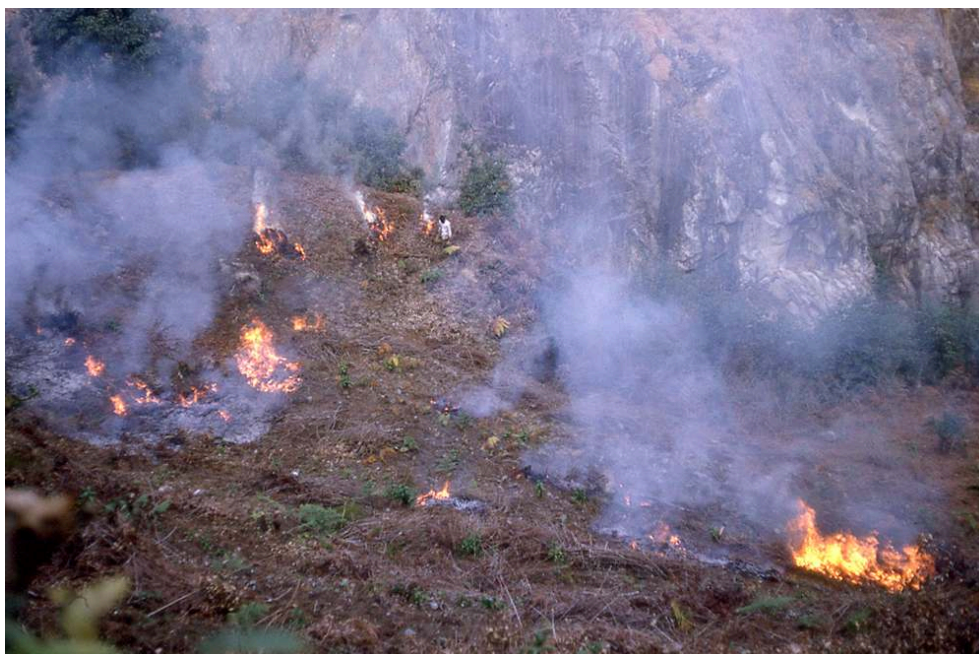
FIG. 2 – Slash and burn

Photo Philippe Sagant 1966–1967; source: LESC_FPS_7.1.1