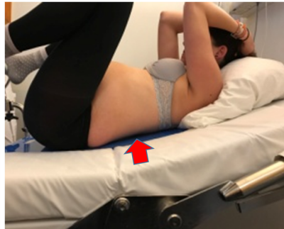
Optimal Supine position (OS)