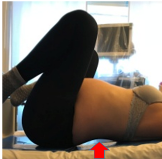
Hyperflexed Supine position (HS)