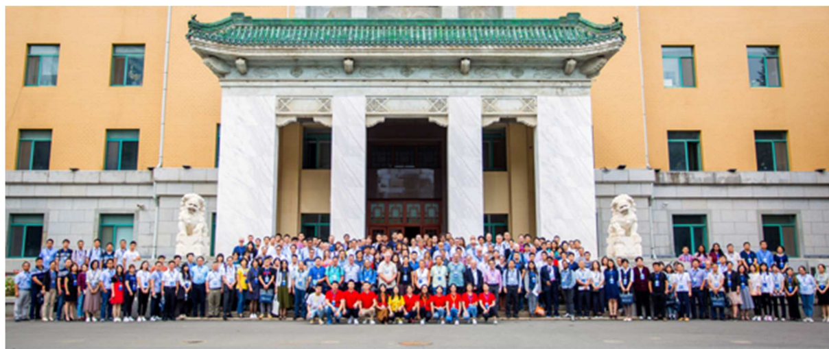
Figure 1: The official picture of all participants taken in front of the Changchun Institute of Applied Chemistry of the Chinese Academy of Sciences.