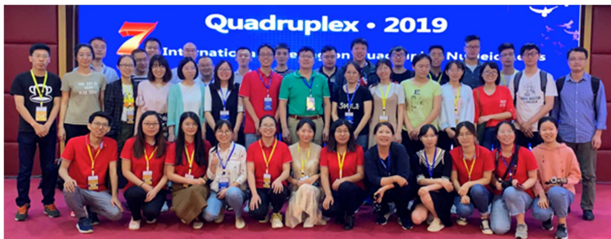
Figure 3: The Changchun organisation team.