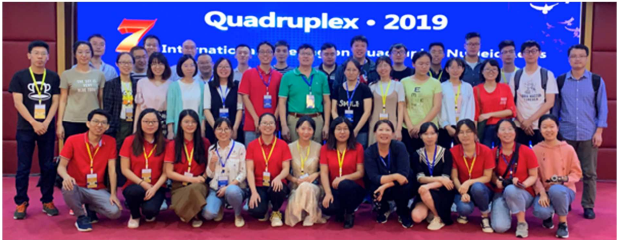
Figure 3: The Changchun organisation team.