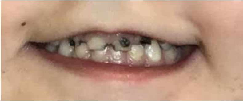
Figure 5: Black inclusion in dental caries related to baby bottle syndrome [patient 3]