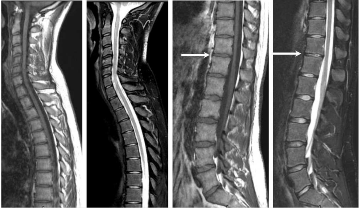
Figure 1: Spine MRI of patient 1