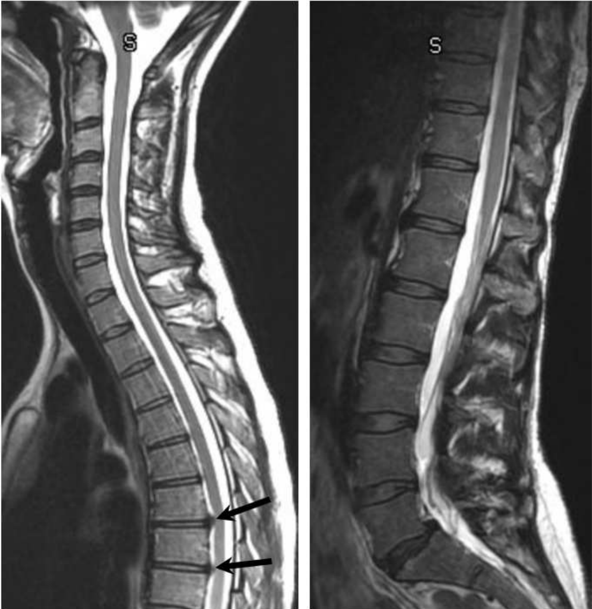
Legend: MR examination in a 34 years old female patient with alcaptonuria. (a, b) Sagittal T2-w.i with fat saturation showing multiple discs alteration with bulging discs at the thoracic level (arrows) and a L5-S1 disc degeneration.