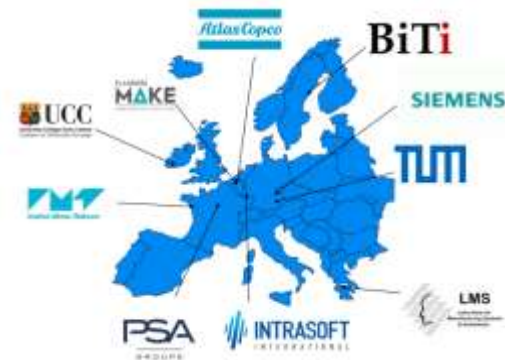
Fig. 3 Project consortium

For the project use cases, the entire ASSISTANT chain will be implemented, starting with data collection, followed by the enrichment of digital twin and leads to the different AI-based decision support tools for process design, production planning/scheduling, and real-time control in manufacturing systems. These decision-support tools (demonstrators) will be tested based on (anonymized) data from “real” business environments within the ASSISTANT framework as stand-alone prototypes. After successful validation of demonstrators, the use cases, system/process specifications, system architecture, concepts, methods, techniques, algorithms, and software code will be available for ASSISTANT consortium partners. They may be incorporated into the studied manufacturing systems for application in daily operations by the consortium partners at their own cost. Most of the results of the project will be disseminated as large as possible in the industry to increase the number of their users. This novel methodology will be validated on a significant panel of use cases selected for their relevance in the current context of the digital transformation of production in major manufacturing sectors undergoing rapid transformations like energy (Siemens), industrial equipment (Atlas Copco), and automotive sectors (Stellantis) which already make extensive use of digital twins. 11 academic and industrial partners are involved, see Fig. 3.