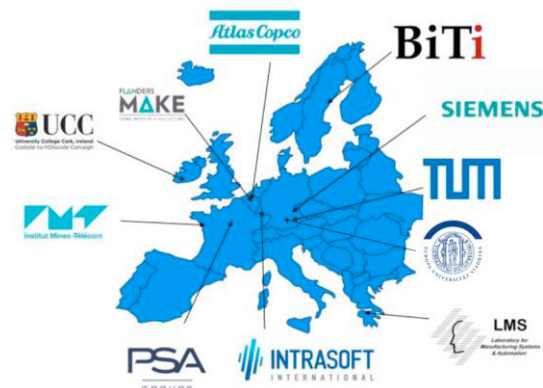
Fig. 3 Project consortium

For the project use cases, the entire ASSISTANT chain will be implemented, starting with data collection, followed by the enrichment of digital twins and leads to the different AI-based decision support tools for process design, production planning/scheduling, and real-time control in manufacturing systems. These decision-support tools (demonstrators) will be tested based on (anonymized) data from “real” business environments within the ASSISTANT framework as stand-alone prototypes. After successful validation of demonstrators, the use cases, system/process specifications, system architecture, concepts, methods, techniques, algorithms, and software code will be available for ASSISTANT consortium partners. They may be incorporated into the studied manufacturing systems for application in daily operations by the consortium partners at their own cost. Most of the results of the project will be disseminated as large as possible in the industry to increase the number of their users. This novel methodology will be validated on a significant panel of use cases selected for their relevance in the current context of the digital transformation of production in major manufacturing sectors undergoing rapid transformations like energy (Siemens), industrial equipment (Atlas Copco), and automotive sectors (Stellantis) that already make extensive use of digital twins. 11 academic and industrial partners are involved, see Fig. 3.