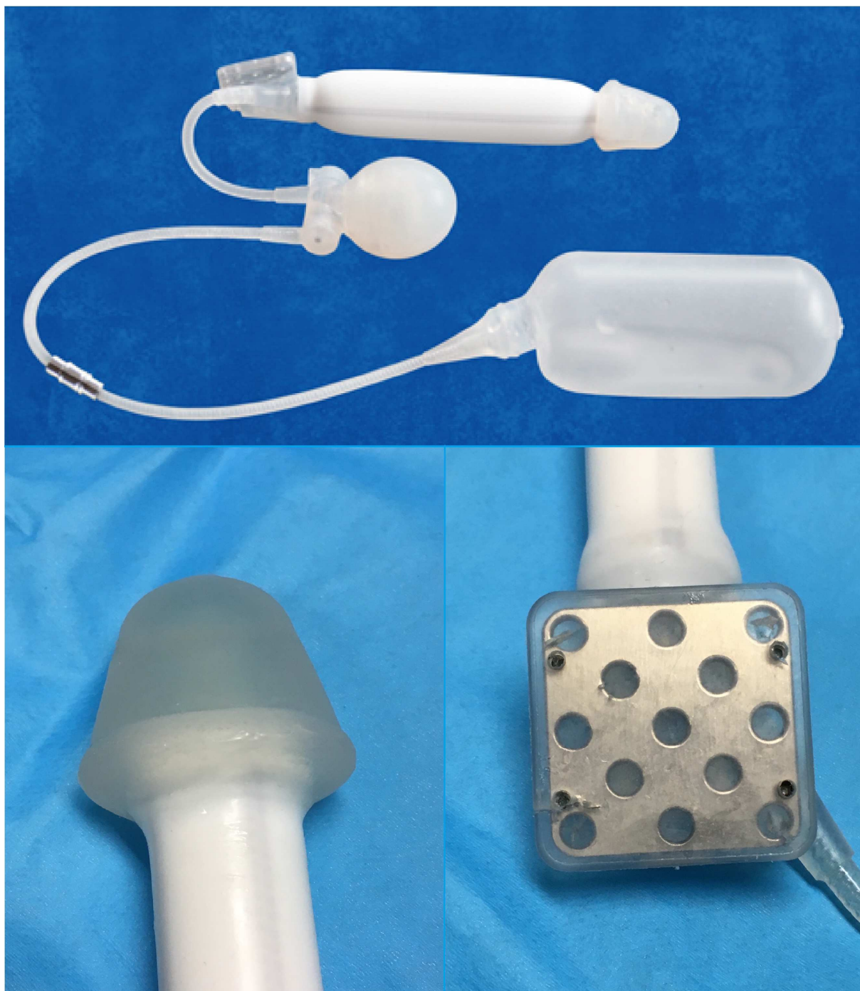
Figure 1: The ZSI ® 475 FtM