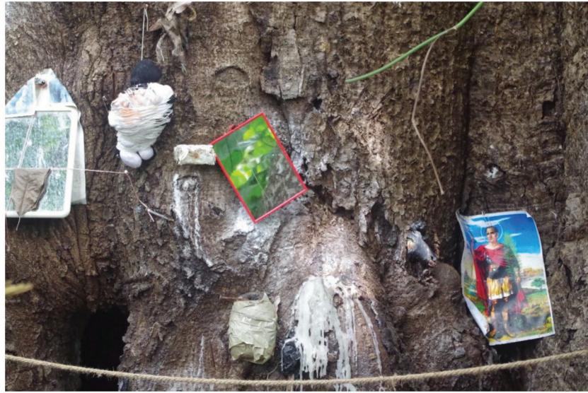
Fig. 3. Ceiba pentandra tree used for voodoo ceremonies in Cayenne, French Guiana. [Colour online.]

protect them (Pesoutova 2019). According to Cabrera (2003), “the dead, the ancestors, the African “saints” of all the African nations that came to Cuba and the Catholic saints go to this tree and inhabit it permanently” (p. 166). The tree, which in Cuba is also never cut down, is called “iroko” by the Afro-Cubans, in memory of the tree revered throughout the Guinea coast, Milicia excelsa (Welw.) C.C.Berg, also called “iroko” in western Africa (Quiroz 2015; Quiroz and van Andel 2018). In addition, in the mythological representations of Afro-Cuban Santería, Iroko is also the name given to an important “orisha” who is believed to live in the trunk of the Ceiba tree in the company of his wife Aboman (Cabrera 2003).