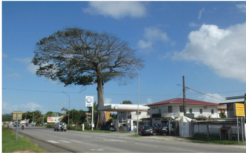
Fig. 5. A preserved silk-cotton tree in Cayenne. [Colour online.]

The species is used for waist pains and as a diuretic among the Pilaga of Chaco (Filipov 1994). Among the Ayoreo, from Chaco as well, the plant is employed to cure open wounds (Renshaw 2006). Some observation of its use against leishmanial external lesions were made among the Wayãpi (Odonne et al. 2011) and the Ashuar (Giovannini 2015) who apply the ground bark directly. This last application is also noted among the Kallawaya in the treatment of tetanic wounds (Girault 1984).