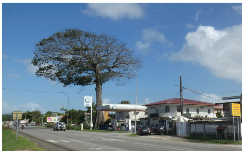
Fig. 5. A preserved silk-cotton tree in Cayenne. [Colour online.]

The species is used for waist pains and as a diuretic among the Pilaga of Chaco (Filipov 1994). Among the Ayoreo, from Chaco as well, the plant is employed to cure open wounds (Renshaw 2006). Some observation of its use against leishmanial external lesions were made among the Wayãpi (Odonne et al. 2011) and the Ashuar (Giovannini 2015) who apply the ground bark directly. This last application is also noted among the Kallawaya in the treatment of tetanic wounds (Girault 1984).