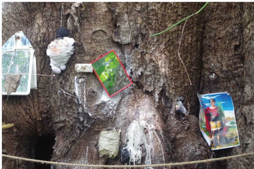
Fig. 3. Ceiba pentandra tree used for voodoo ceremonies in Cayenne, French Guiana. [Colour online.]

protect them (Pesoutova 2019). According to Cabrera (2003), “the dead, the ancestors, the African “saints” of all the African nations that came to Cuba and the Catholic saints go to this tree and inhabit it permanently” (p. 166). The tree, which in Cuba is also never cut down, is called “iroko” by the Afro-Cubans, in memory of the tree revered throughout the Guinea coast, Milicia excelsa (Welw.) C.C.Berg, also called “iroko” in western Africa (Quiroz 2015; Quiroz and van Andel 2018). In addition, in the mythological representations of Afro-Cuban Santería, Iroko is also the name given to an important “orisha” who is believed to live in the trunk of the Ceiba tree in the company of his wife Aboman (Cabrera 2003).