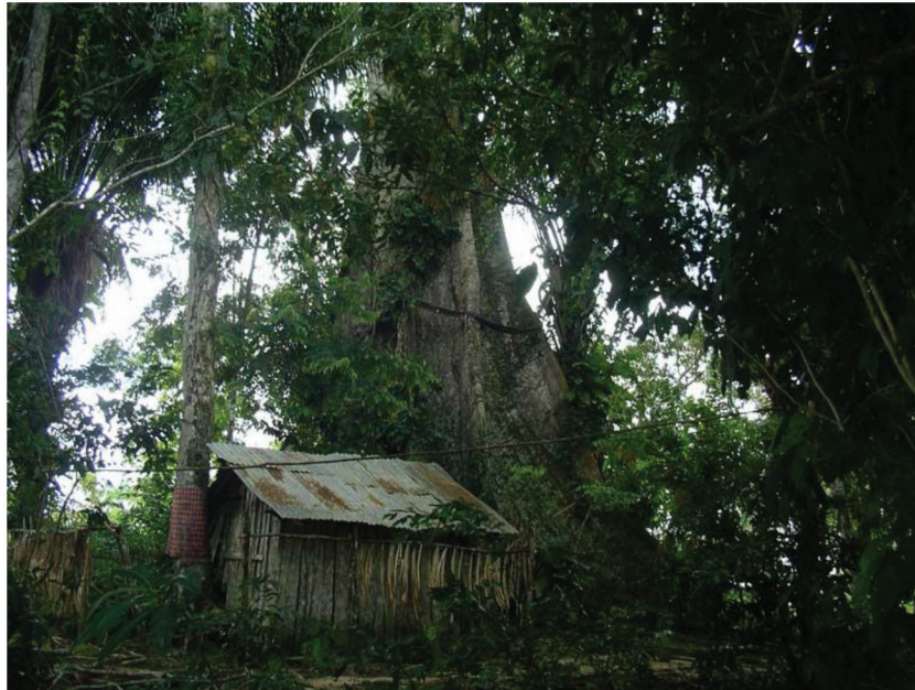
Fig. 4. A Ndjuka maroon healing house (“Obia osu”) under a Ceiba pentandra in 2004 close to the Maroni River. [Colour online.]

missionary Verschuur reported the “kankantii” tree as the most venerated tree of the Maroons of French Guiana (Verschuur 1894) and contemporary testimonies confirm this idea: “the “kankantii” is like a lightning rod, it attracts evil spirits. It shelters both the good and the bad ones. . . the Ampuku spirit lives in the big “kankantii”, that’s why we don’t cut it down or burn it. We put beers at its foot for them. It is also where we make music for the “obia” [spirits]. People also bathe under the “kankantii” for good luck, but if you use its leaves or bark to make remedies, you have to pay him with beer and rum. If someone is possessed, they are bathed under the “kankantii” so that the Ampuku spirit in the person returns home”, explained a Saamaka man living in Matoury, French Guiana.