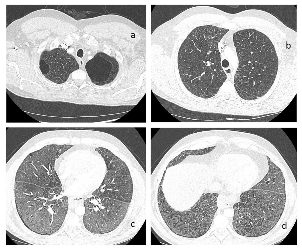
Figure 2: chest computed tomography of case#2. a: upper lobes with apical emphysema and b: septal thickening. c: middle-lung mixed interlobular and intralobular lines with ground glass opacities. d: lower lobes with ground glass and distal bronchiolectasis.