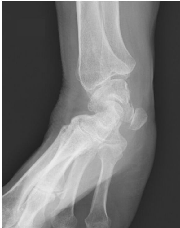
Fig. 1. X-rays of primary pisotriquetral joint (PTJ) osteoarthritis (wrist in 30° supination)