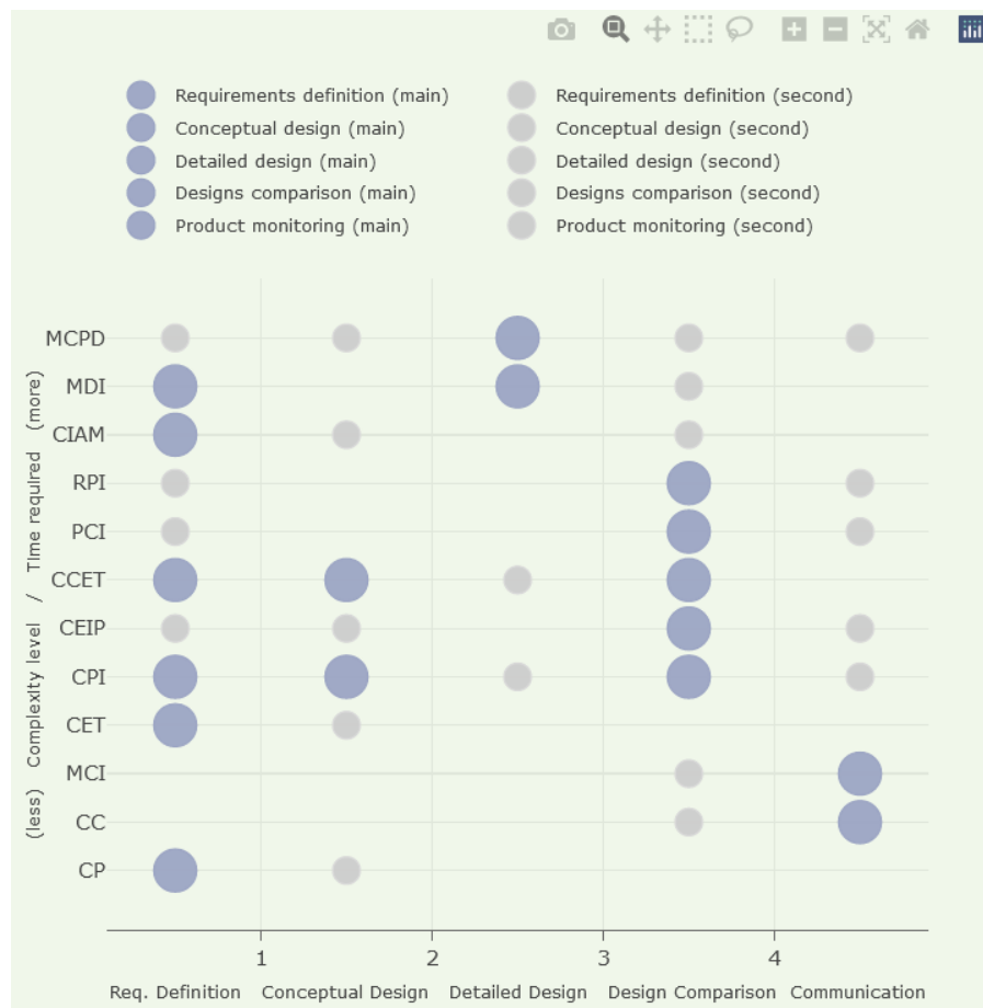
FIGURE 2: WEB-BASED TOOL TO VISUALIZE AND SELECT C-INDICATORS DURING THE PRODUCT DESIGN PROCESS

For instance, on the one hand, the CEIP or the CET enable simple calculations and can be applied with little to no training and limited data, which is convenient during the early phases of the design process, where less detailed information is available at this early point in the development process. On the other hand, the MDI or the MCPD are more data and calculation demanding, i.e., applying these c-indicators requires access to more detailed data, but they can guide further on the detailed design of products. In between, the CCET or the CPI, and their respective calculation spreadsheets, appear to be intermediate and commendable solutions to both support decision making to design circular product and compare concepts, while being simple enough to enhance the understanding of non-expert designers on the circular economy concept.