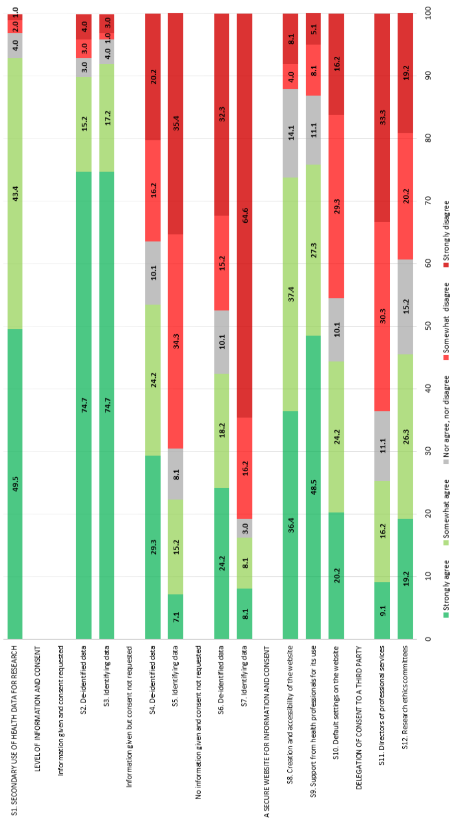
Figure 2. Level of agreement of REC member respondents toward each survey item.