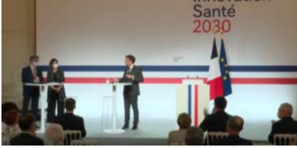
Présentation de la stratégie innovation santé 2030 par le Président Emmanuel Macron. Juin 2021.

By contrast, 18 months into the covid19 pandemic, Emmanuel Macron's announcement of the Health Innovation Strategy 2030, wherein 750 million euros was allocated to combating infectious diseases (out of an unprecedented 7 billion euros of funding focused on three priorities), appears to challenge the epidemiological transition model. The question we ask is whether this reorientation addresses contemporary medical problems that were prevalent when covid19 emerged, and that have evolved since. We also hope that our answer will shed light on how two social scientists can opine on this issue not only as observers of 'what is happening in medicine', but also as actors working and publishing in close collaboration with medical teams (2) .