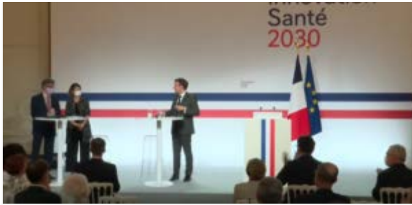
Présentation de la stratégie innovation santé 2030 par le Président Emmanuel Macron. Juin 2021.

By contrast, 18 months into the covid19 pandemic, Emmanuel Macron's announcement of the Health Innovation Strategy 2030, wherein 750 million euros was allocated to combating infectious diseases (out of an unprecedented 7 billion euros of funding focused on three priorities), appears to challenge the epidemiological transition model. The question we ask is whether this reorientation addresses contemporary medical problems that were prevalent when covid19 emerged, and that have evolved since. We also hope that our answer will shed light on how two social scientists can opine on this issue not only as observers of 'what is happening in medicine', but also as actors working and publishing in close collaboration with medical teams (2) .