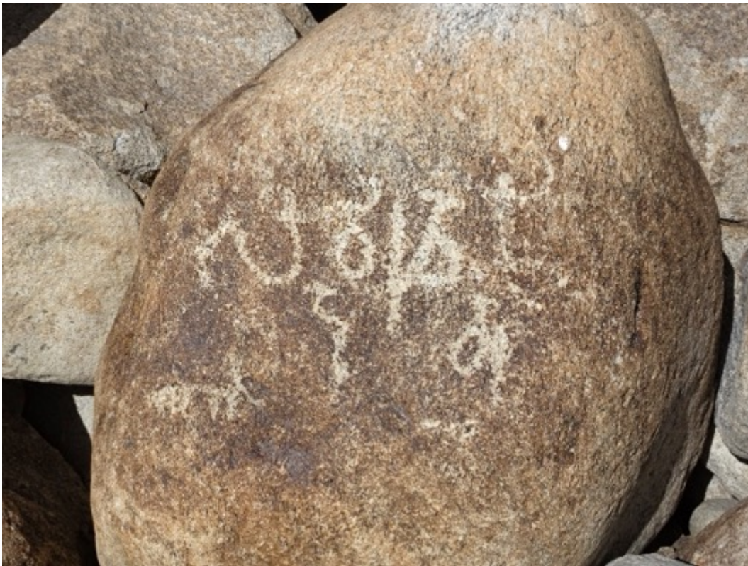
Fig. 15. Inscription at Henache.

reminiscent of Central Asian architecture. The carvings of Henache consist of zoomorphs, anthropomorphs, stūpas, and geometric images, including dancing figures similar to those typically found in western Ladakh.