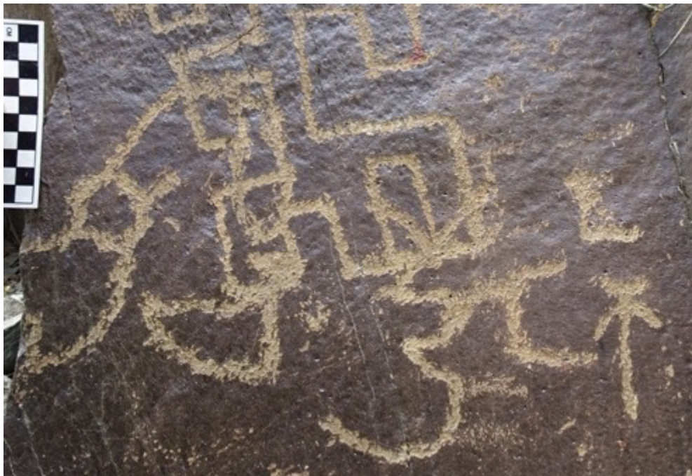
Fig. 11. Waru inscription 4

Waru inscription 3 (fig. 10): śrī-pu[ṅdra]sya : The reading of the second and third syllables is very uncertain (hence in brackets). They seem to have been faultily written, and it is possible that they were intended to represent a single akṣara . One could imagine that the intended reading was something like śrīpuṅyasya or śrīpuṅyendrasya , but the name as it stands cannot be convincingly interpreted.