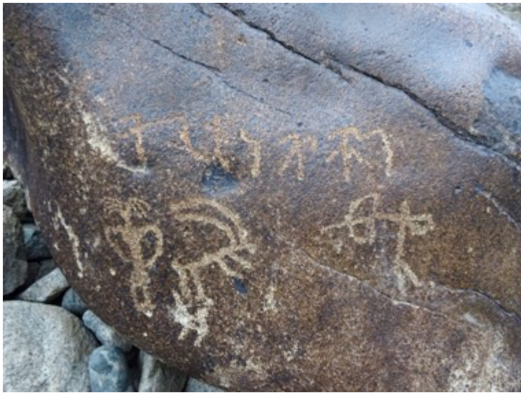
Fig. 5. Inscription documented by Tashi Ldawa Leh and Sonam Wangchuk at Kanutse

All three inscriptions consist of the same text with slight variations. Harry Falk described the first two examples as follows: 12