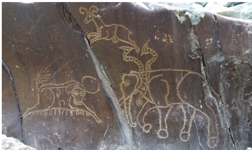
Fig. 7. Some of the petroglyphs at Waru bridge

of these inscriptions is rather difficult, and only a general range of about the third to seventh centuries CE can be suggested. 17