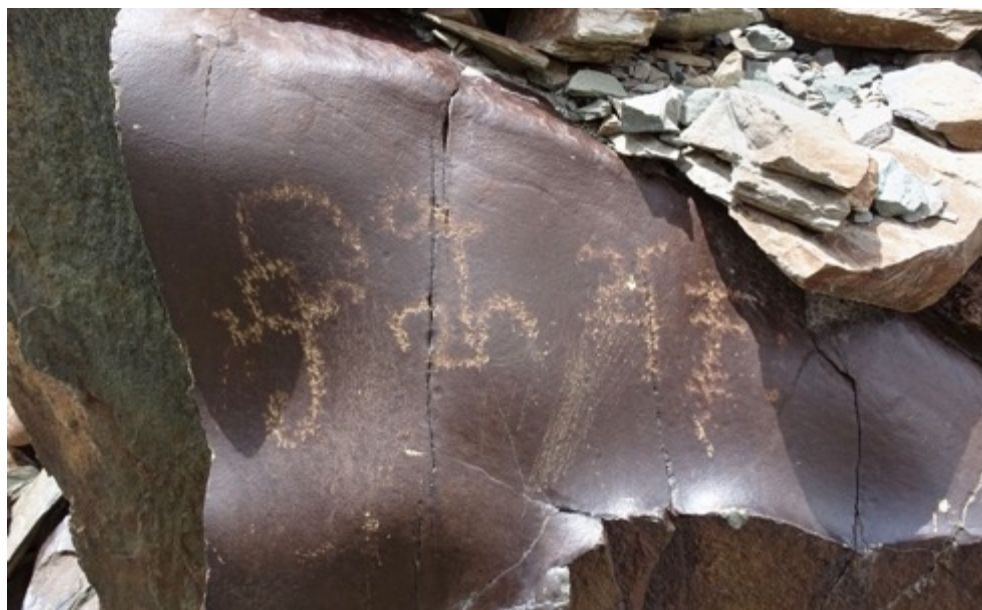
Fig. 8. Waru inscription 1

We propose, with due hesitation, the following readings for the Waru inscriptions: