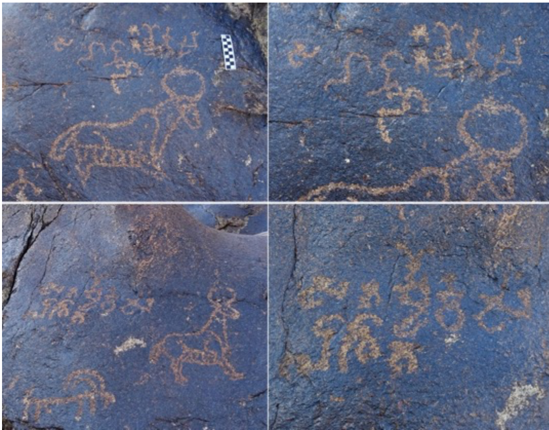
Fig. 6. Inscriptions at Lehdo bridge

Falk’s estimate of an early date on the basis of the preconsonantal r in the syllable rṣa seems reasonable, as it consists of a curved line across the stem of the r , rather than being written in continuous loop at the bottom of the stem as is done in later Kharoṣṭhī. Falk’s analysis of the name, however, is speculative, and is cast into doubt by the discovery at a later date of the third inscription containing the same name in which, however, the third syllable seems to be ko rather than rv , and this reading is at least possible in the two other copies. Thus the actual intended reading in all three versions may have been varṣako-raja-hasta , “The signature of King Varṣaka” or “The signature of Varṣakorāja.” 14 Here, as is so often the case with graffiti inscriptions, the personal name is obscure and perhaps best not subjected to etymological analysis.