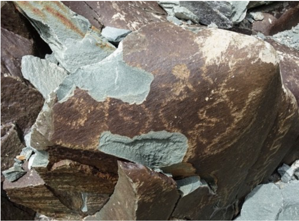
Fig. 9. Waru inscription 2

The formula of this inscription, consisting of a name in the nominative (as here) or stem form, or in the genitive case (as in the next inscription) prefixed by the honorific śrī(r) is characteristic of the corpus of graffiti inscriptions along the Indus, including sites in Pakistan and in Ladakh, and is seen in several other of the new examples presented here, in both Brāhmī and Kharoṣṭhī.