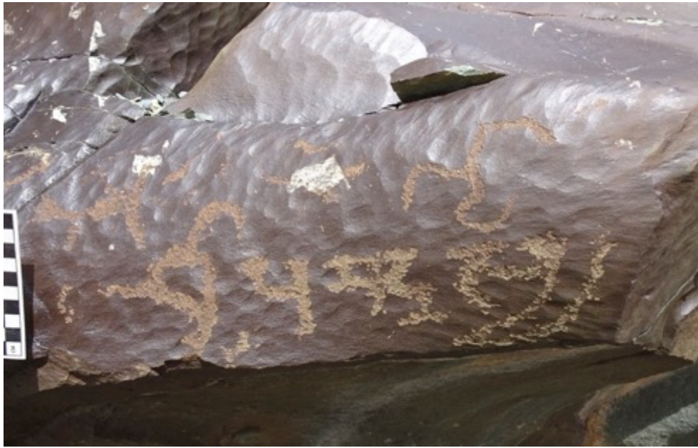
Fig. 10. Waru inscription 3

Waru inscription 3 (fig. 10): śrī-pu[ṅdra]sya : The reading of the second and third syllables is very uncertain (hence in brackets). They seem to have been faultily written, and it is possible that they were intended to represent a single akṣara . One could imagine that the intended reading was something like śrīpuṅyasya or śrīpuṅyendrasya , but the name as it stands cannot be convincingly interpreted.