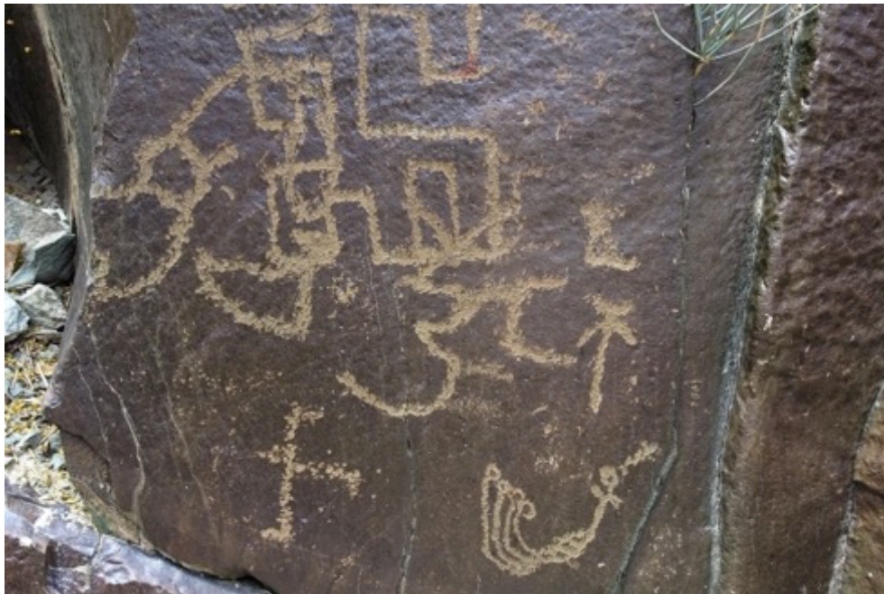
Fig.12. Waru inscription 4, showing designs below the inscription

This part of the extended curve is partly obscured by the meander-like design which is carved vertically above the inscription. The design could be the work of Candraka himself, to judge by the similar quality of its engraving. There are also several other stray marks above and below the name (see fig. 12), including a svastika and a peacock design below it.