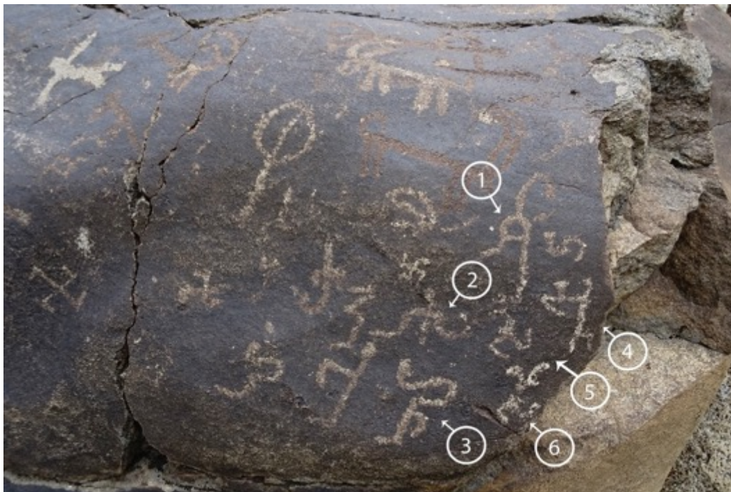
Fig. 13. Inscribed stone at Kharul with inscriptions labeled

(the original name of the region of Kargil in Ladakh). Confluences and gorges in general were commonly taken as border features in these mountain regions, as opposed to passes which on the contrary were often considered as unifying features linking valleys together.