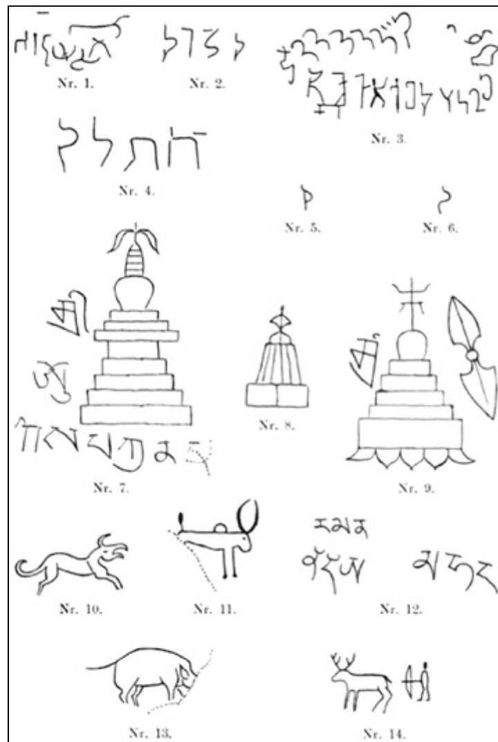
Fig. 3. Indian inscriptions at Khaltse (from Francke 1907: Tafel II)

rulers as seen on coins and sculptures since Vima Kadphises' reign. 4 The rock bearing these carvings was unfortunately destroyed in recent times.