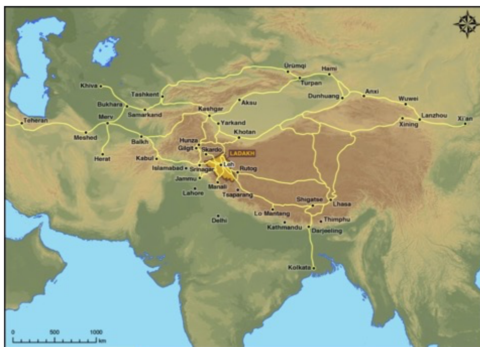
Fig. 1. Ladakh within the network of the so-called Silk Routes

In view of its location between Tibet and the extreme north of the Indian subcontinent, it is not surprising that historical inscriptions in a wide variety of languages and scripts have been found in Ladakh (figs. 1-2). There are in Ladakh well over five hundred rock inscriptions in Kharoṣṭhī, Brāhmī, Śāradā, Chinese, Sogdian, Tocharian, Tibetan, and Arabic scripts. The present article focuses on the earliest stratum of Indian-language and -script inscriptions, namely those in Kharoṣṭhī and Brāhmī. All of these but one are found in western (“lower”) Ladakh (i.e. west of the confluence of the Indus and Zaskar Rivers), and some of them may date back as far as the first century of the Common Era. Only one is found outside of the Indus valley, located along the Siachen river in Nubra, the northern region of Ladakh. We will both review the previously published specimens in this section, and present in the second section some newly discovered ones.