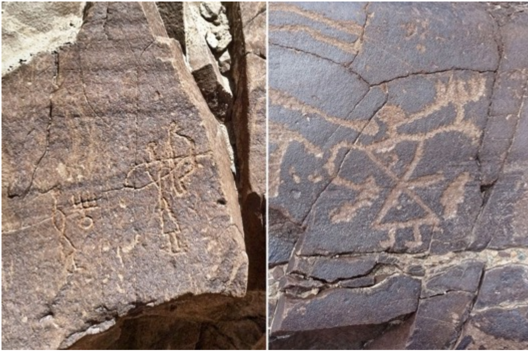
Fig. 16. Depictions of tamgas at the Zaskar-Indus confluence (left; photo courtesy Viraf Mehta), and between Alchi and Lardo (right).