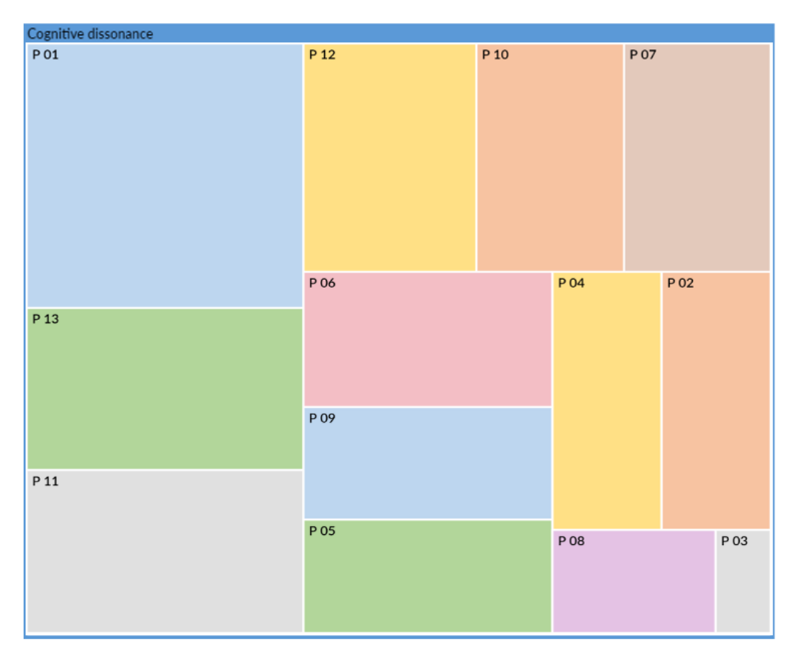
Figure 2. Proportion of evocation of a form of cognitive dissonance verbalized by each participant.

Participants described the contradiction between the need to isolate the dependent elderly people to protect them from the virus and the consequences that these precautionary measures could have on the lives of these people.