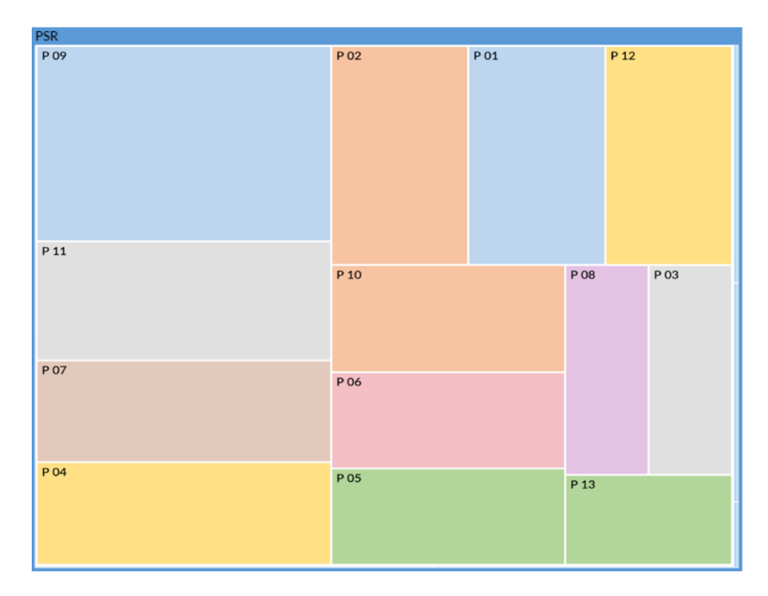
Figure 3. Proportion of statements of at least one psychosocial risks factor verbalized by each participant.

Each colored rectangle corresponds to sentences expressed by each participant, and the area of each of these rectangles is proportional to the number of verbatims coded for each participant out of the total number of verbatims coded for psychosocial risks. These are ranked in descending order of size. We can see that P09 (23 verbatims) expressed the most psychosocial risks factors, and P13 (6 verbatims) expressed the least.