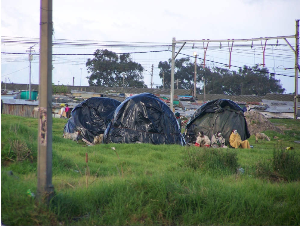
Figure 4: Gugulethu's buffer zone. a-2009 and b-2013.