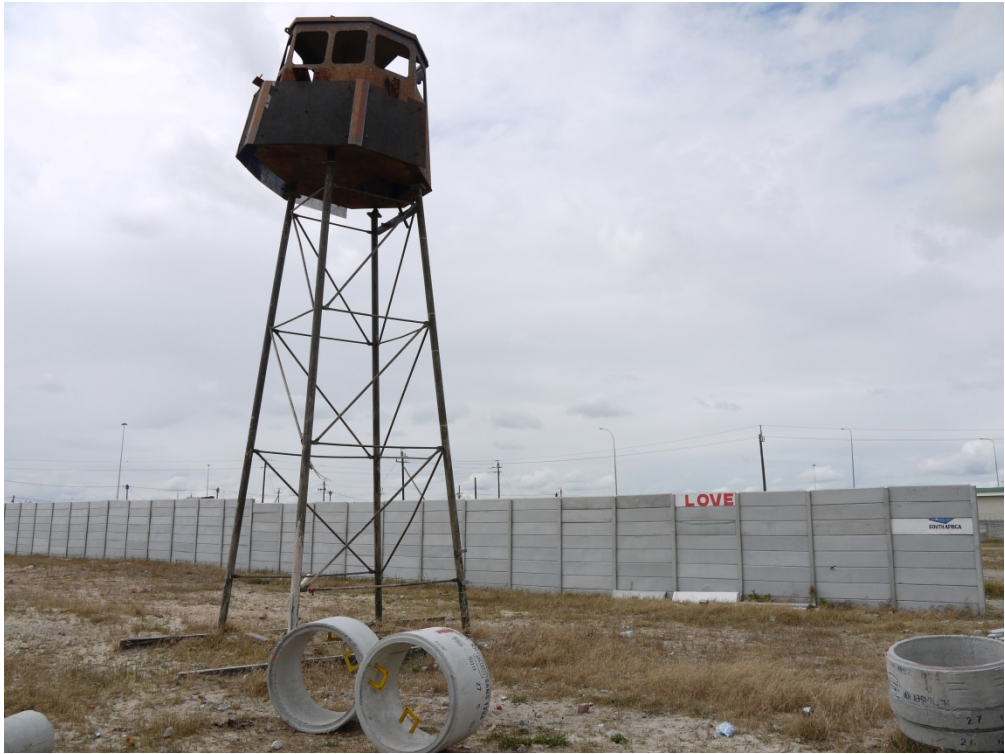
Figure 3: Disused mirador next to Khayelitsha stadium, built for the surveillance of social events happening in the stadium, specifically the political funeral rallies of the late 1980s. Photo by the author, 2011.