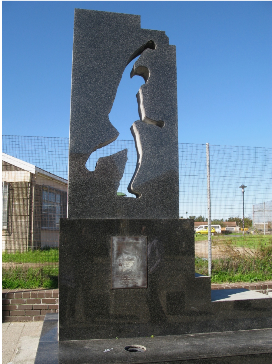
Figure 2: Official memorial to the Gugulethu Seven.