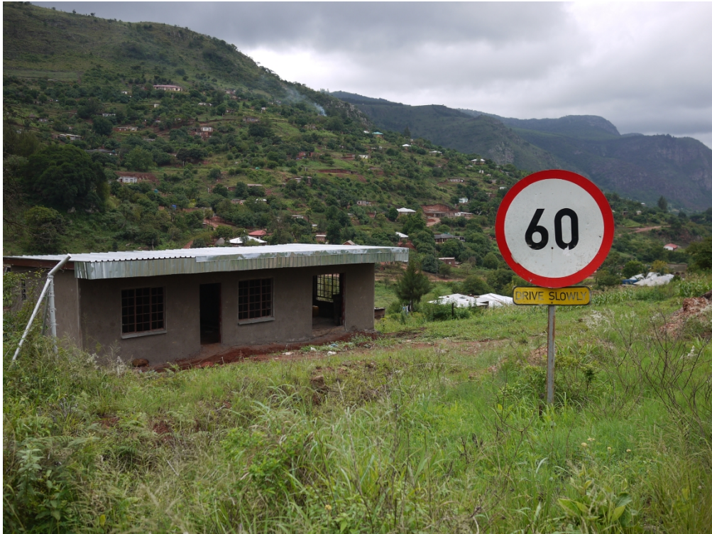
Figure 1: The former Venda border.