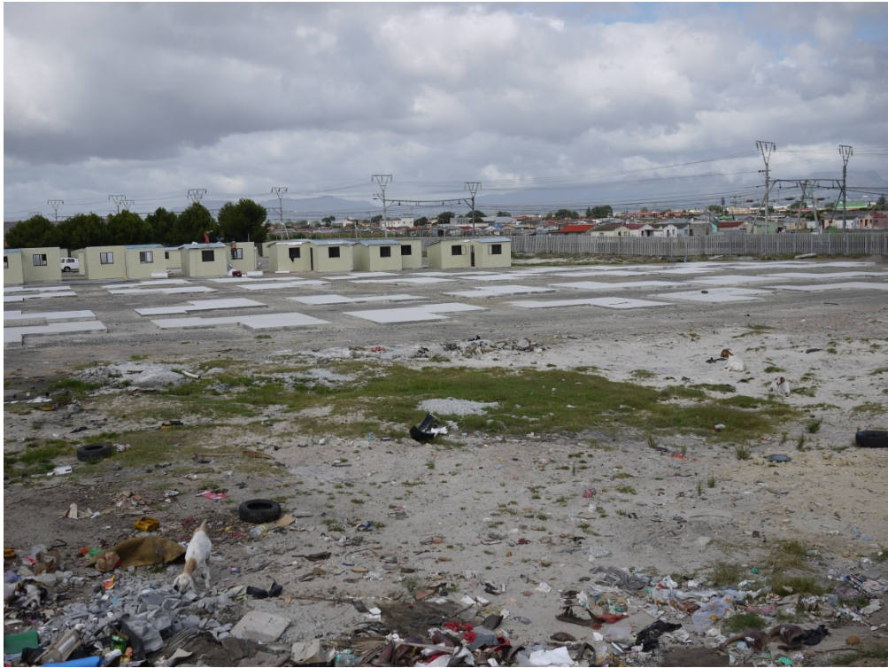
Figure 4: Gugulethu's buffer zone. a-2009 and b-2013.