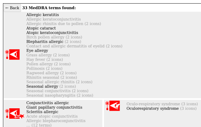
Figure 4– Screenshot of the panel shown when clicking the “allergic inflammation of eye” icon in Figure 3 (the one marked with a green dot).

ure 4 shows an example of such a panel, obtained after clicking on the “allergic inflammation of eye” icon on Figure 3 (it is the icon marked with a green dot). The panel shows 2 more specific child icons: “allergic inflammation of the optic nerve” and “allergic edema of eye”.