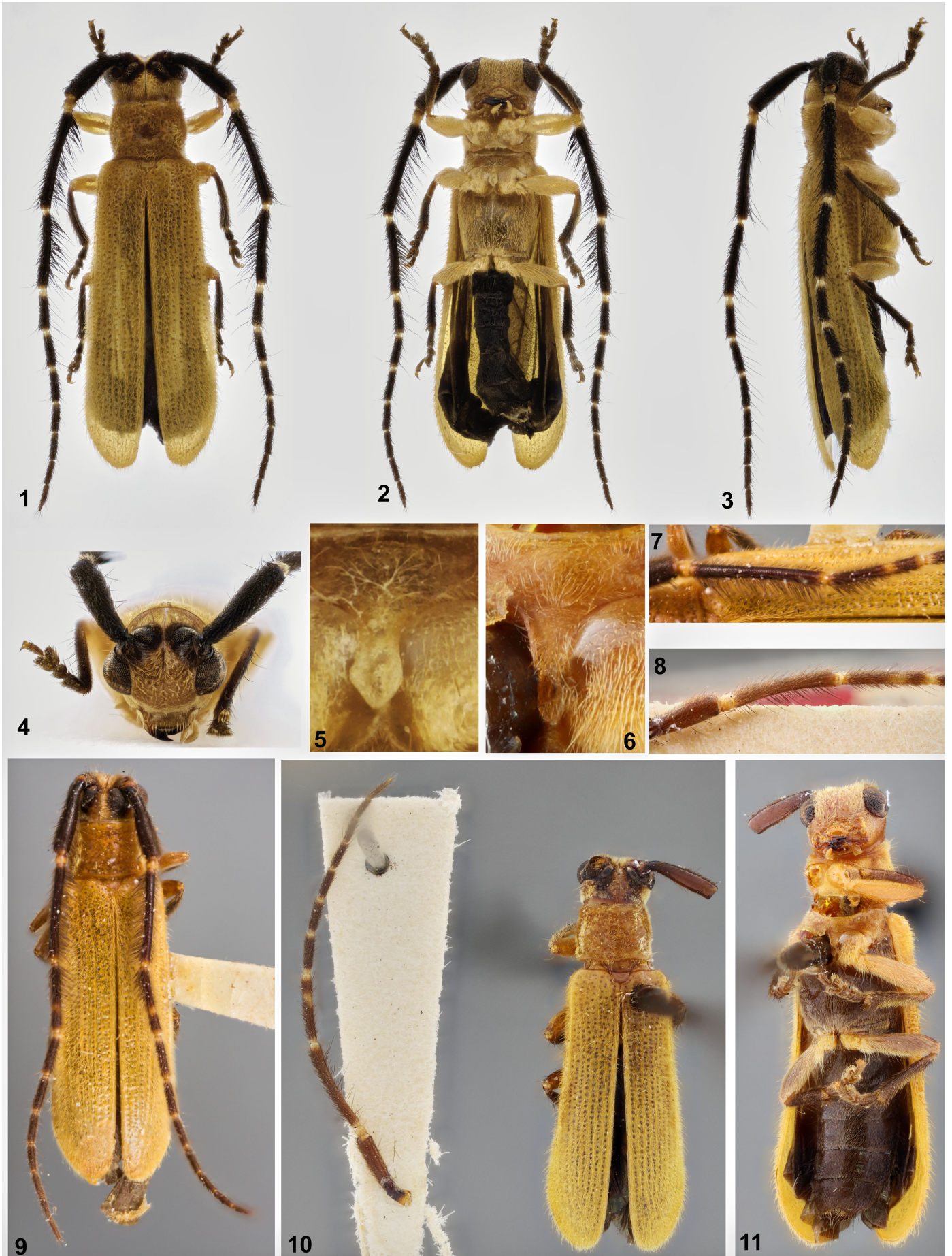
Figures 1–5) Tyrinthia lidiae sp. nov., holotype, ♂.

1) Dorsal habitus; 2) Ventral habitus; 3) Lateral habitus; 4) Head, frontal view; 5) Mesoventral process.