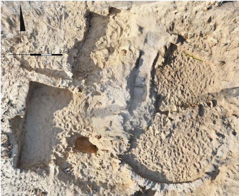
Fig. 7. Orthophoto of sector GQA4 (V. Ghica).