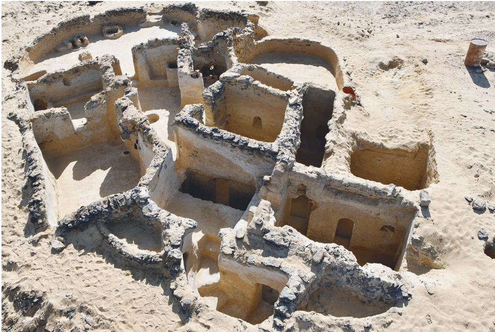
Fig. 2. Sector GQA6 at the end of the 2020 excavation season (V. Ghica).

original stratigraphy recovered in GQA5 and GQA6 is identical to that observed in GQA1 and GQA2, where the elevation of the walls is similar.