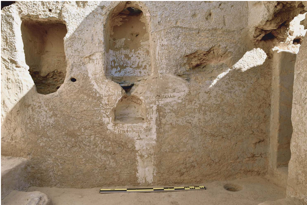
Fig. 5. Wall east of room P6 in GQA6 (R. Williams).