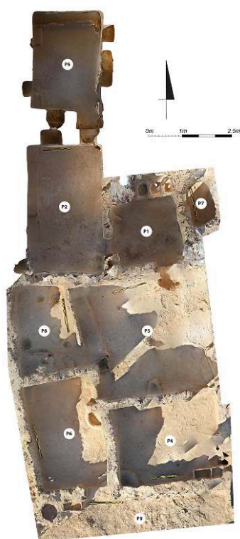
Fig. 6. Orthophoto of sector QGA5 (A. Di Miceli, V. Ghica).

P5) and storing rooms (P1). P3 was a central distributing space, which gave access to all the other rooms or groups of rooms (such as the group P1-P2-P5). Attached to P3, was P8, a small storing space, with a floor higher than the one of P3 and provided with stairs that led likely to the outside. Large storage vessels, broken, were found in this room confirming its role. Rooms P4 and P6, built to the south of the central space P3 had both cooking installations. Finally, P9, constructed to the south of P4 and P6, is a kitchen built at a later stage. The pottery found in GQA5, particularly a LRA 1A amphora (Egloff 169, dated to the end of the 4th or 5th century) and several small sigā -flasks (dated in Bahariyya to the end of the 4th or to the 5th century 1 ), indicate that this sector (except, perhaps, the later addition P9) was abandoned during the 5th century. The construction typology of the troglodytic area (P1, P2, P5) might suggest, by analogy with its correspondent in GQA1 (GQA1 phase 1), a 4th century date. Radiocarbon dating of organic material collected in relevant layers will refine the chronology of the occupation in GQA5. No inscribed material was found in this sector.