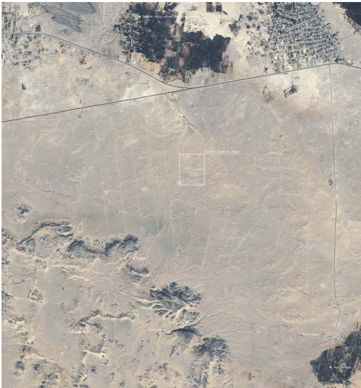
Fig. 1. Satellite photo showing Tell Ganub Qasr al-Aguz and the area between Qasr al-Aguz (to the north) and Gabal Hafhuf (to the south) (V. Ghica, on a GeoEye-1 satellite; photo taken on October 9, 2013).