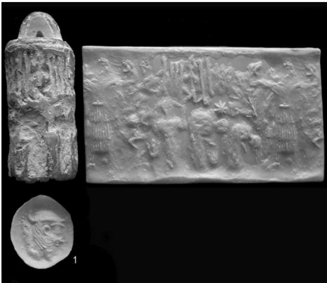
Figure 1. The Jalalabad seal and its modern impressions (originals kindly provided by E. Ascalone).