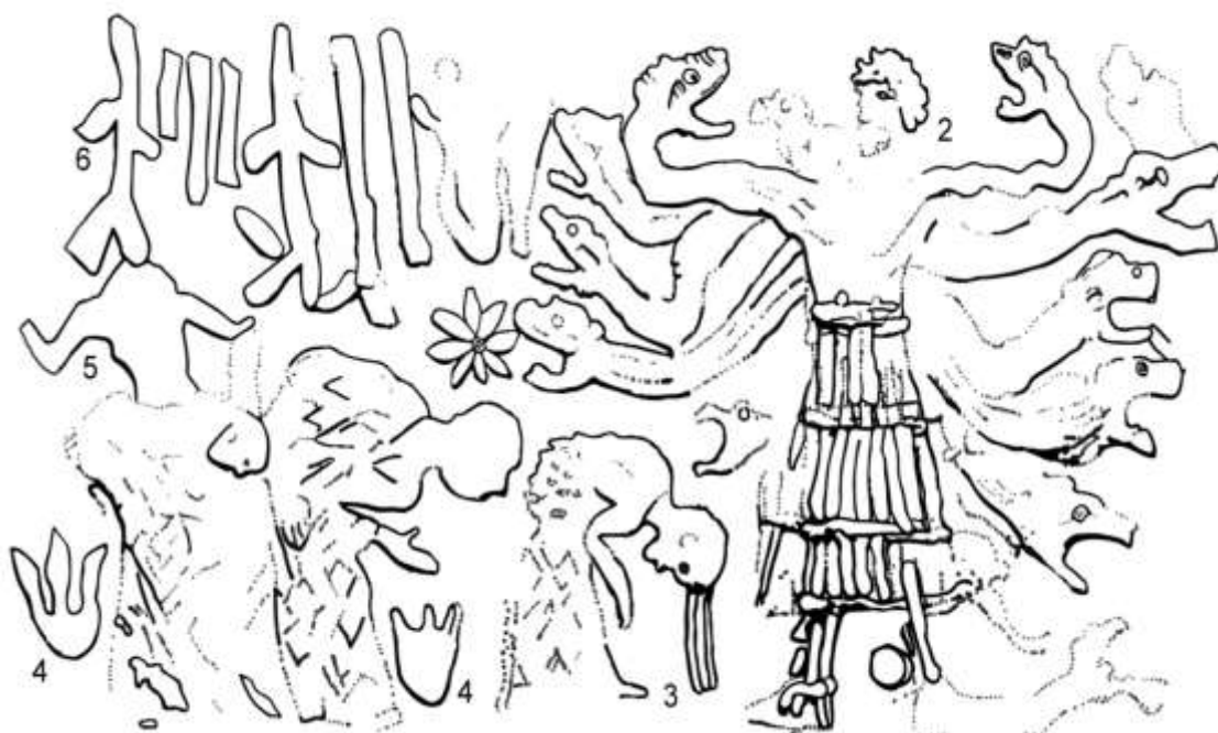
Figure 2. Graphic interpretation of the iconography of the Jalalabad seal, digitally retraced after the modern imprint of Figure 1. The various elements (1 to 6) are separately discussed in the text.