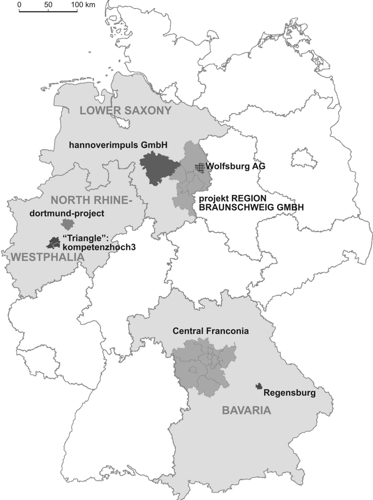
Figure 2. Map of Case Study Regions

regions of Hannover, Braunschweig and Nuremberg whose populations range from 1.1 million to 1.7million inhabitants.