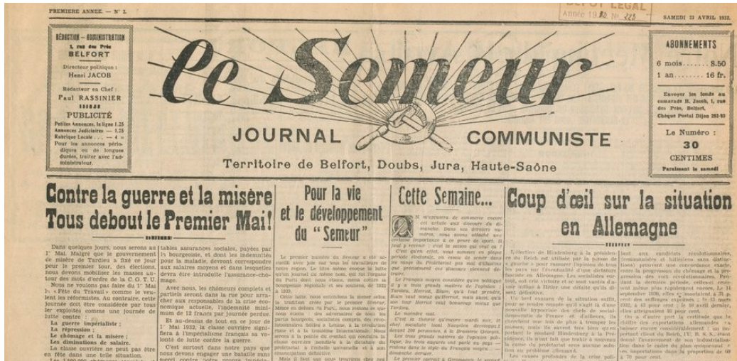
Figure 1: Excerpt of the first page of the second issue of the communist newspaper Le Semeur published the 23rd of April 1932