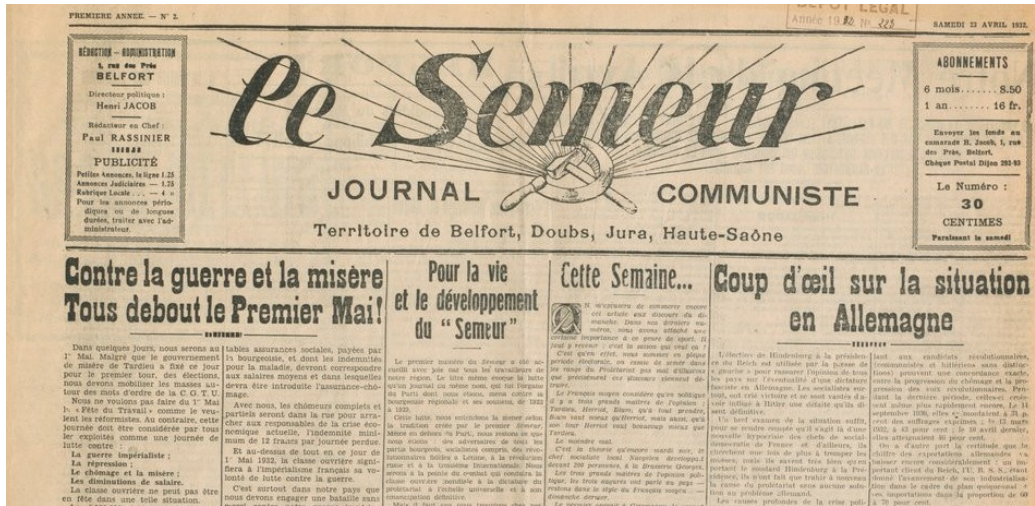
Figure 1: Excerpt of the first page of the second issue of the communist newspaper Le Semeur published the 23rd of April 1932