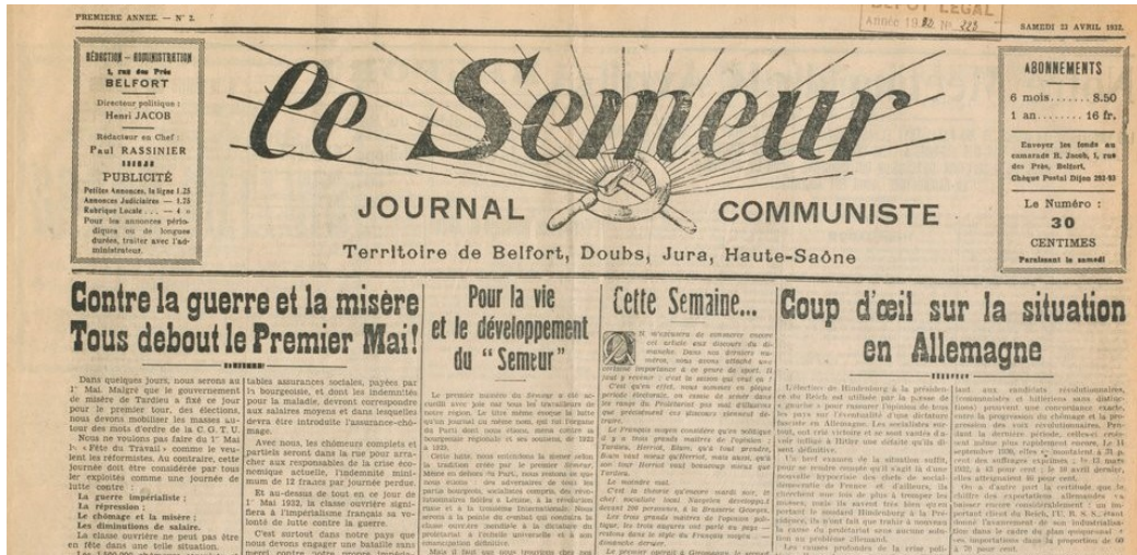
Figure 1: Excerpt of the first page of the second issue of the communist newspaper Le Semeur published the 23rd of April 1932