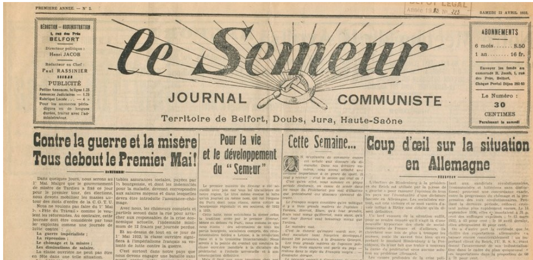
Figure 1: Excerpt of the first page of the second issue of the communist newspaper Le Semeur published the 23rd of April 1932