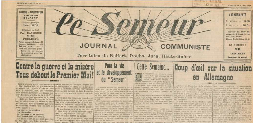
Figure 1: Excerpt of the first page of the second issue of the communist newspaper Le Semeur published the 23rd of April 1932