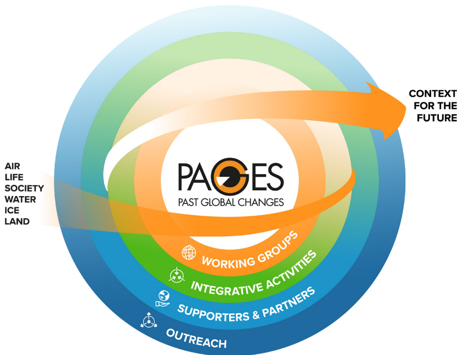
Figure 3: PAGES' proposed new science diagram (2021-). Concentric circles represent the building blocks of PAGES, which at its core is composed of working groups and integrative activities within PAGES' scope. Their research supports partner programs, informs strategies for sustainability, and provides outreach opportunities. The arrow represents the integration of information and learning that propels the paleosciences forwards and provides context for future projections.

PAGES will continue to be community-driven, with the support of its lean, efficient, and productive International Project Office. This includes even more global collection, dissemination, and synthesis across spatial and temporal scales, for phenomenologically meaningful regions and dimensions (e.g. patterns within and across elements in Fig. 3) by means of Open Science Meetings 2 and clustered meetings, in which multiple working groups convene to consider shared interests and opportunities, such as the Topical Science Meetings. 3 Although we acknowledge that personal contacts are at the heart of international science, we anticipate that meetings will become more and more internet-enabled, and virtual, to reduce their carbon footprint. This will enhance the goals of building a community, but also improve accessibility, which is especially important for an increasingly global PAGES.