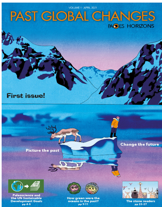
Figure 4: The first issue of PAGES' new magazine for anyone interested in paleoscience, Past Global Changes Horizons , was published in April 2021. 19

19 http://pastglobalchanges.org/products/pages-horizons